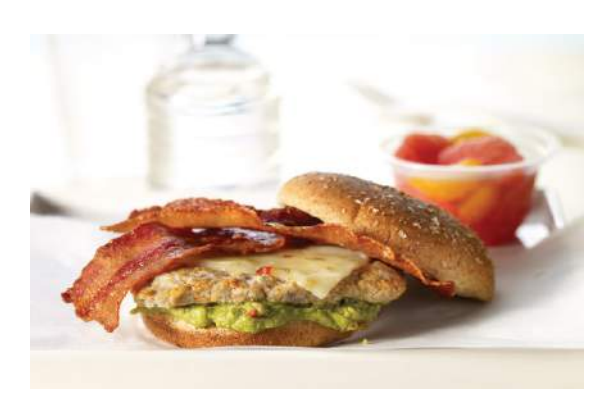
California Dreamin' Burger

JENNIE-O® All Natural products fit the growing demand for simpler, minimally processed foods, while fully meeting the demand for great taste. JENNIE-O® All Natural products are minimally processed and no not contain any artificial ingredients.